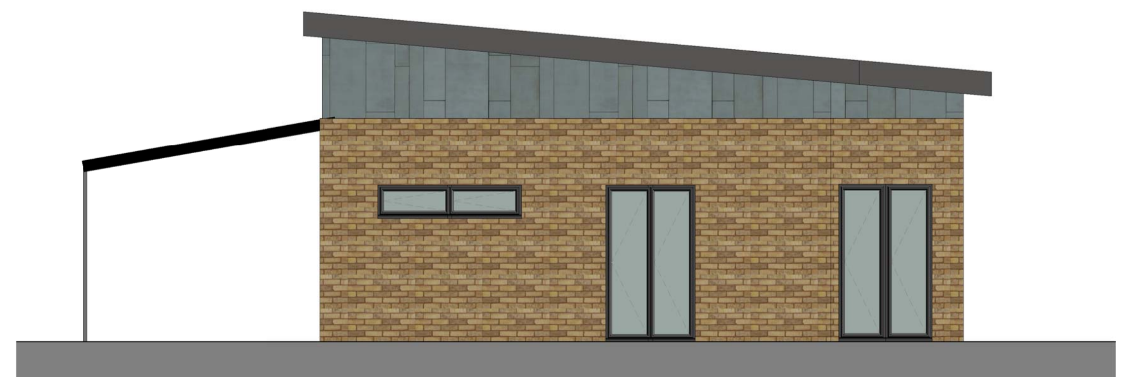
Elevation 6 - a PC