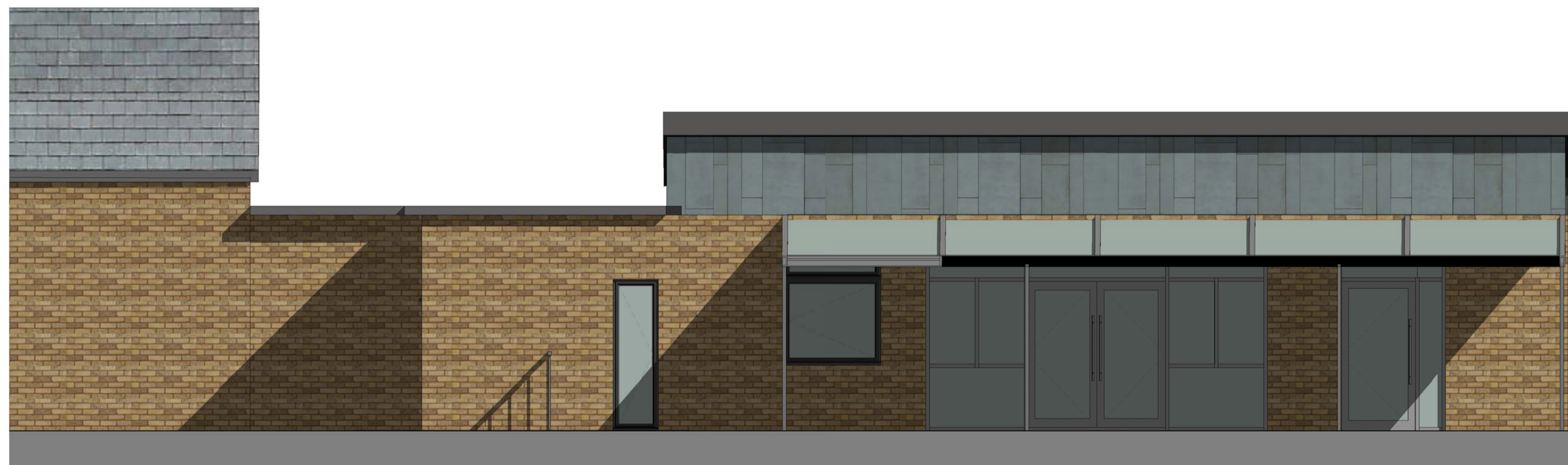
Pre School Elevation PC